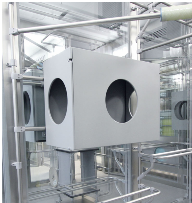
Primate cage with resting zone