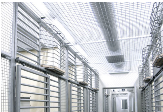
Primate cages fitted with balconies