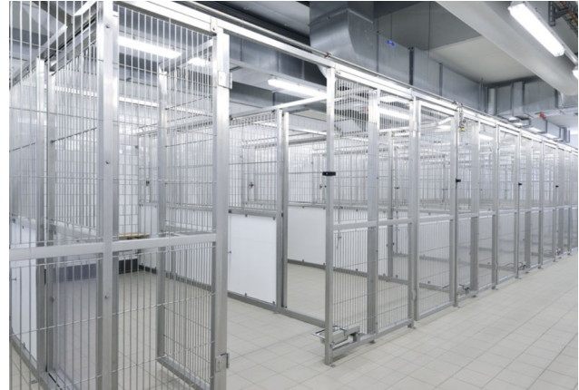
Large enclosure for dogs or cats